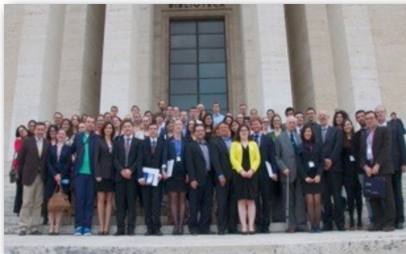
European Regional 2013