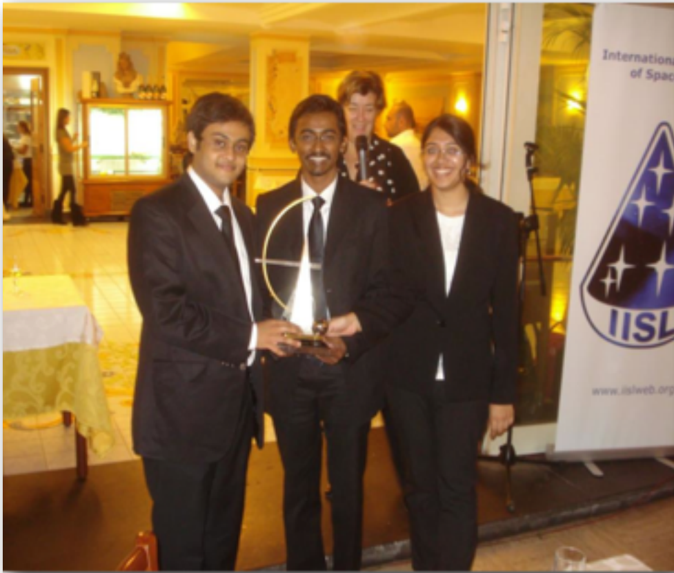
National Law School of India Winner of the World Finals 2012, Naples, Italy