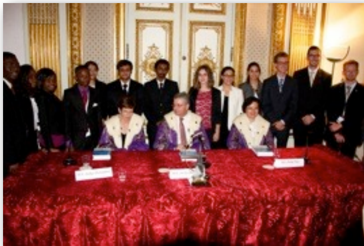
World Finalists, Naples 2012

The 2013 Problem was written by Prof. Setsuko Aoki (Japan).