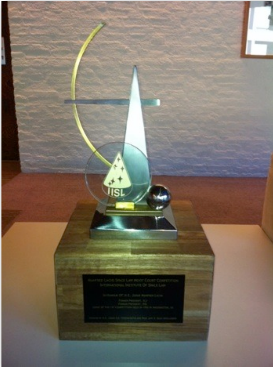
On Permanent Display, International Court of Justice The Hague, The Netherlands