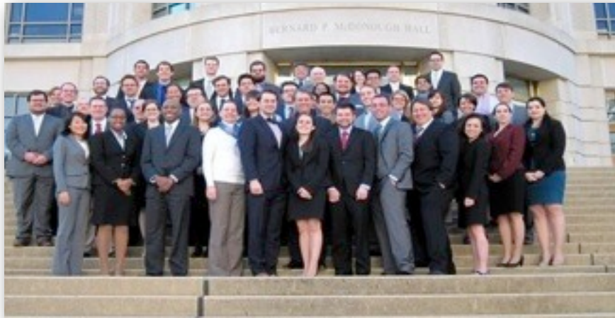
North American Regional 2013