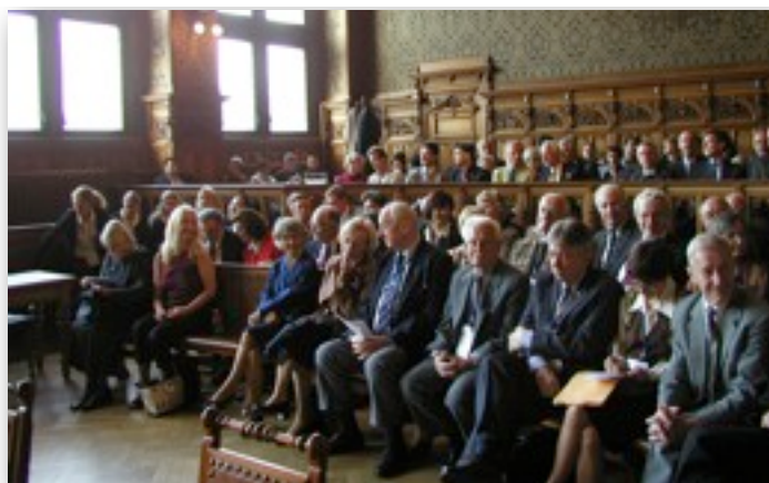
World Finals, Bremen, 2003

No. 16B, Hepingli Middle Street, Beijing, China