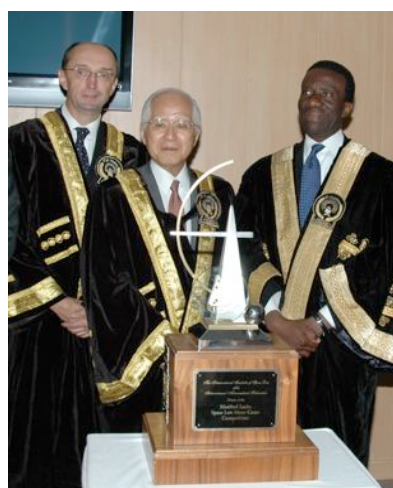
World Finals 2007, Hyderabad, India