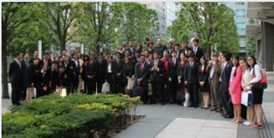
Asia Pacific Regional 2013