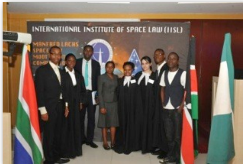
African Regional 2013

The 22nd Manfred Lachs Space Law Moot Court Competition will be held in Beijing, China. The Semi-finals will be held on Tuesday, 24 September 2013. The Finals are a public event and will take place on Thursday 26 September, at the Beijing Institute of Technology School of Law and will be judged by judges of the International Court of Justice in The Hague.