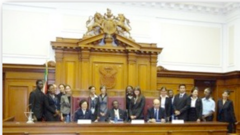
Cape Town, 2011