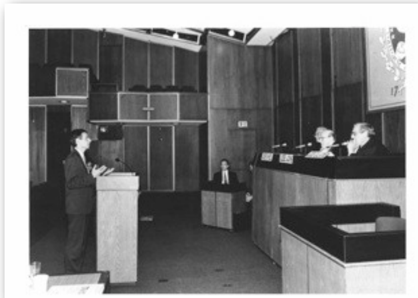
1992 Oral argument Washington, D.C.