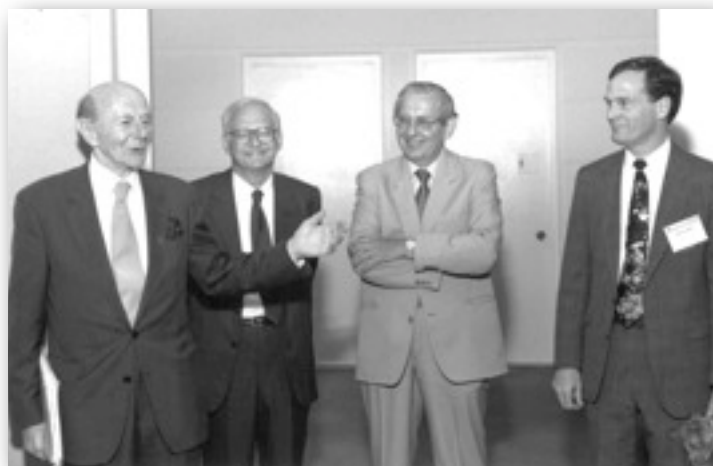
The first IISL Moot Court Competition

He may never have imagined that after his death his name would be used, with the permission of his family, for the space law moot court competition of the IISL and thus be remembered by so many space law students and other persons involved in the competition.