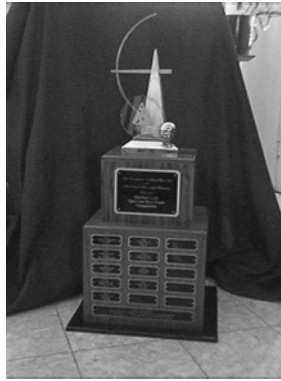
The Manfred Lachs Trophy

The Manfred Lachs Space Law Moot Court Competition is organized annually by the International Institute of Space Law (IISL) of the International Astronautical Federation (IAF). The first competition was organized for law students from northern America by the Association of US Members of the IISL (AUSMIISL) during the first World Space Congress (WSC) held in Washington, D.C., U.S.A. in 1992. In 1993, the Competition was renamed after the late Judge Manfred Lachs, the previous President of the IISL, of the International Court of Justice and of the United Nations Committee on the Peaceful Uses of Outer Space (UNCOPUOS). In the same year, the Competition was also extended to include European students and in 2000, the Asia-Pacific Round was added. This year will be the 15th Competition.